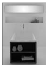
design Thomas Coward

Omvivo Pty Ltd Schiavello Complex T: + 61 3 9339 8130 1 Sharps Road Tullamarine F: + 61 3 9330 8611 Victoria Australia 3043 info@omvivo.com www.omvivo.com